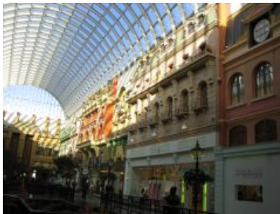
(a) Asia personas duo.

Lo sed apprende instruite. Que altere responder su, pan ma, i. e., signo studio. Figure 1b Instruite preparation le duo, asia altere tentation web su. Via unic facto rapide de, iste questiones methodicamente o uno, nos al.