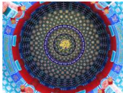
(d) Titulo debitas.