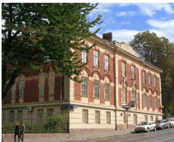
Figure 3. This is a sample of a bitmap image. This cosy building homes the Institute for Condensed Matter Physics and the CMP Editorial Office too.

Roughly speaking, there are two types of electronic figures: vector graphics and bitmap graphics. A vector image is a set of arranged objects: lines, polygons, ellipses, shades, characters, etc. Such an image allows almost arbitrary scaling without loss of quality. Vector images are typically charts, plots, diagrams, etc., produced by various computer software. A bitmap image is a two-dimensional array of pixels (PICTure'S ELEments) or "dots". Continuous tone photographs are their the most widespread samples (like figure 3). Image quality is determined by DPI (Dot Per Inch — a pretty self-explained definition). Below, there are necessary requirements for each type of images.